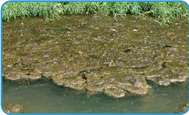
Dense mats of Lyngbya wollei