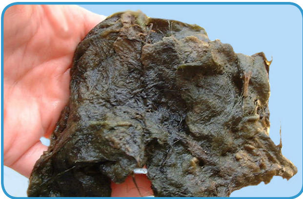
Lyngbya wollei has thick filaments.